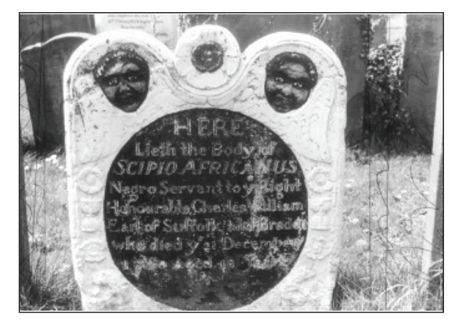
An unintended memorial to Bristol's part in the inhuman transatlantic slave trade