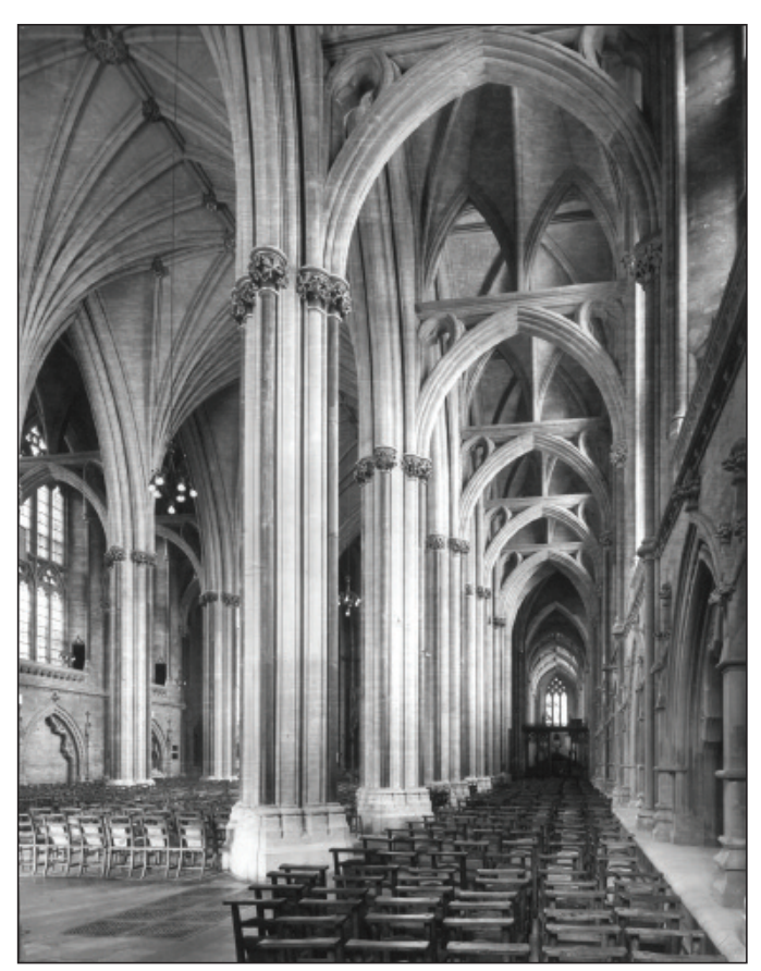
Bristol cathedral: the south aisle.