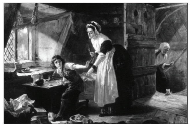
Imaginary scene from the childhood of the precocious poet Thomas Chatterton painted by Henrietta Ward in 1873.