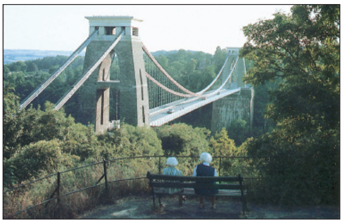
The elegant Clifton Suspension Bridge over the Avon Gorge.